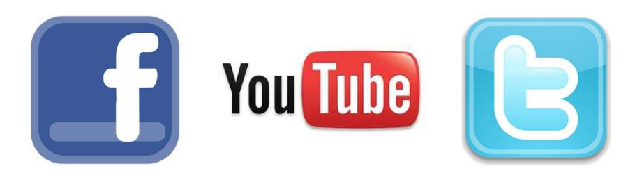
Facebook @ straightlineperformanceinc Youtube @ straightlineperfinc Twitter @ straightlineperf

Technical questions please email tech@straightlineperformance.com