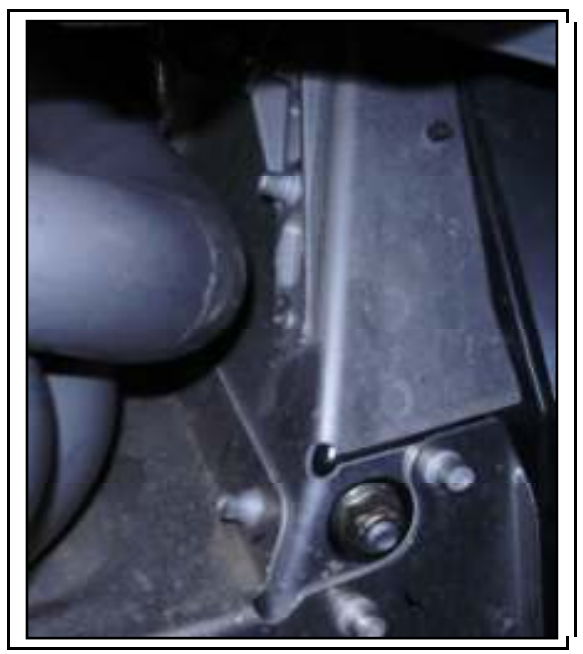
(Re-install the button head screw as shown)

Jetting Requirements: No Jetting Required