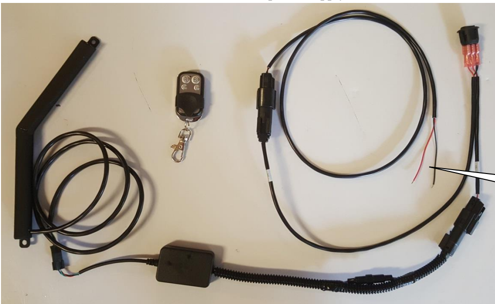
Connect these wires to power