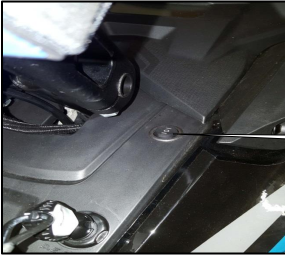
LED Button Installed.