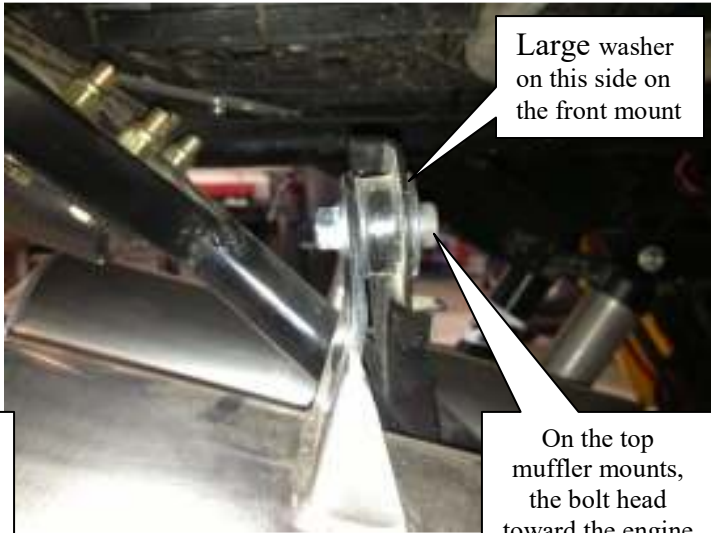
Large washer on this side on the front mount