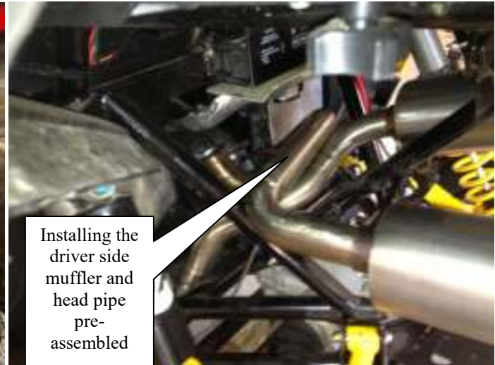
Installing the driver side muffler and head pipe pre-assembled