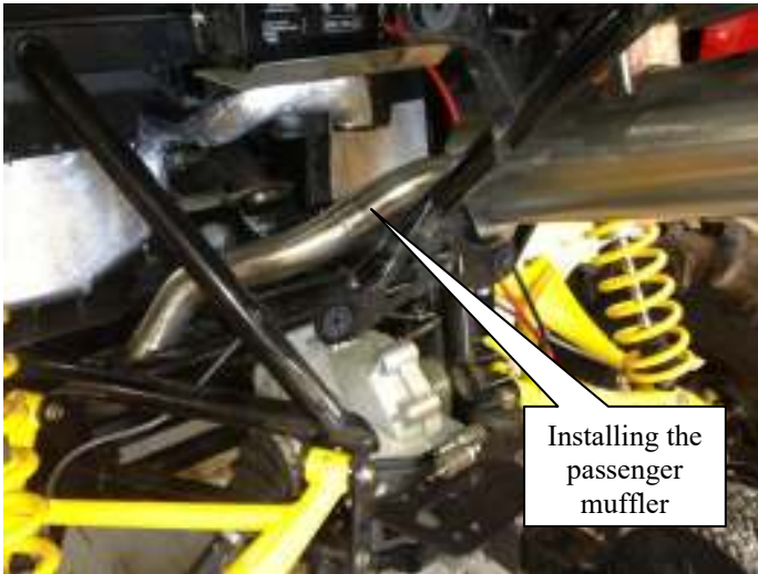
Installing the passenger muffler