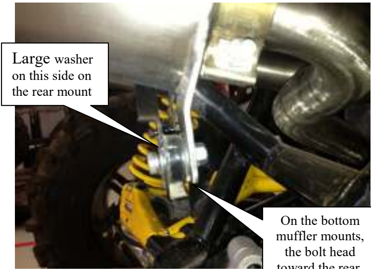
Large washer on this side on the rear mount