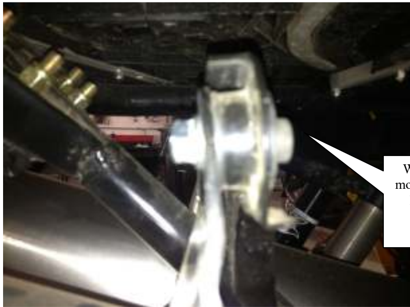
When installing the muffler mounts, use a small amount of lube to install the bolts to avoid any rubber binding during installation